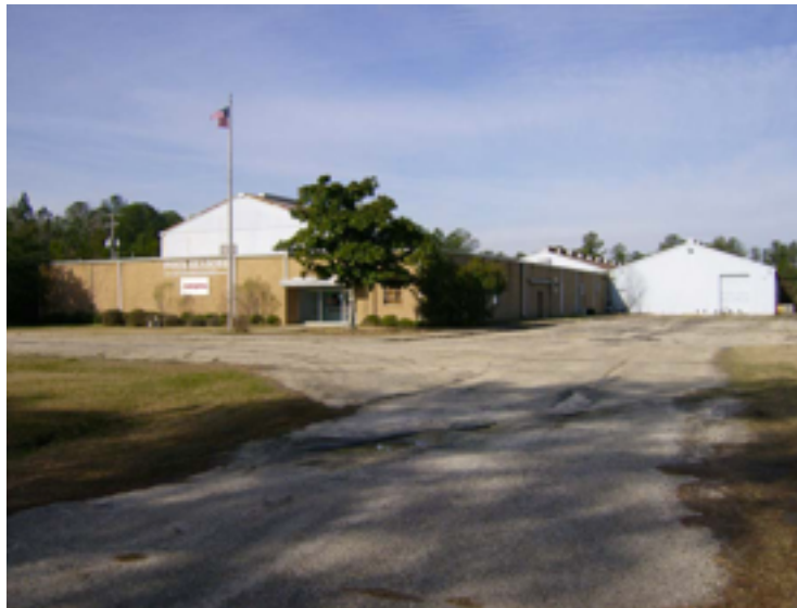
Warehouse "B" 56,000 sq.ft.