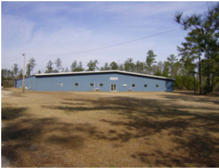
Warehouse "A" ,42,000sq.ft.

Contact: Chuck Cooper (843.240.2912 or 843.237.5553)